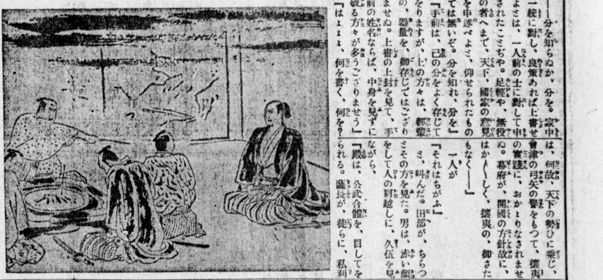
Illustration of a person sitting at a table, possibly a scene from a story or a portrait.