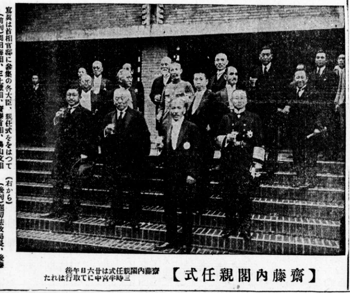
【式任親閣内藤齋】 後日六廿は式任親閣内藤齋 たらは行取て在中半時三