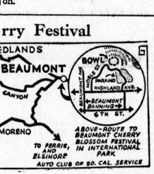
Petite Japanese dancers will present the quaint and charming rites of the land of their parents, Nippon, in the annual Japanese cherry blossoms festival at Beaumont in Southern California, Sunday, Apr. 3. The map shows the way into International Park pageant site and the cherry orchards in Full Bloom.

The local Bussei Ramblers will be putting in their last public appearance here at the Salvation army court on Saturday eve from 8:30 with the Mt. View Kyowans in their final game.