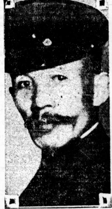
Lieutenant General Sadao Araki, Minister of Army in the present Inukai Cabinet, who possesses decisive power for war or peace in the present Sino-Japanese dispute in Shanghai area.