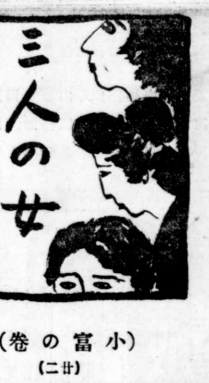
三人の女 (巻の富小) (二廿)