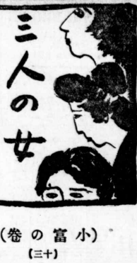
三人の女 (巻の富小) (三十)

二月月上旬入超 千九百方圓 見越買原因 (東京十日電) 見越買の買手は千九百方圓の大入超である。