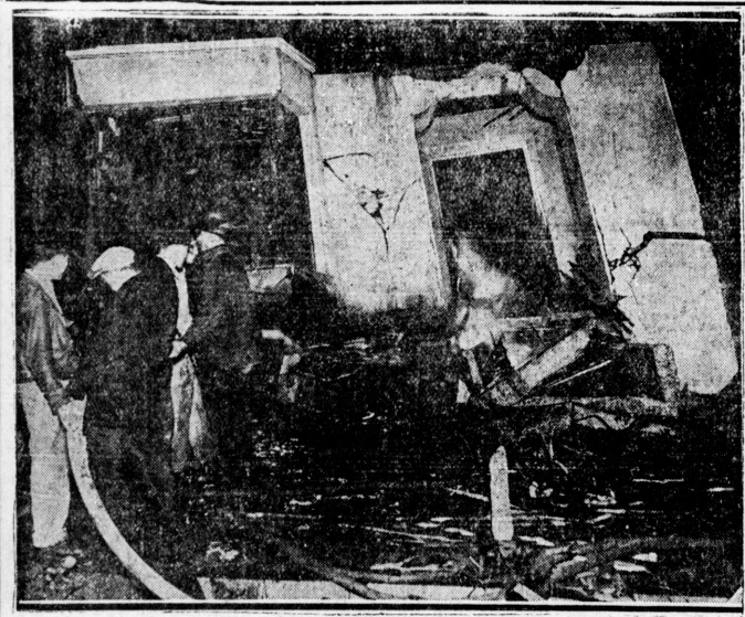
たし出を餘名十七者備果結果の發場スヤ日三去 <明説眞寫> 跡遺宅氏一ダナサの編事集の來近