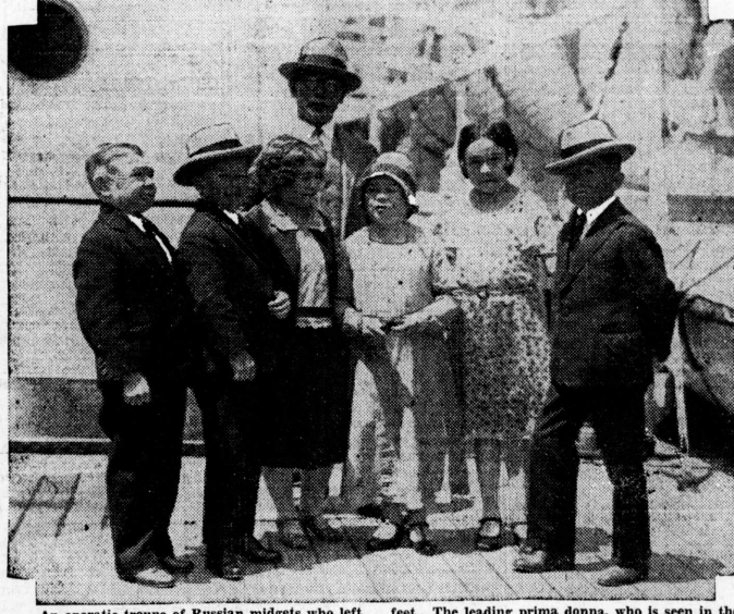
An operatic troupe of Russian midgets who left San Francisco on the Asama Maru Thursday for an engagement in Japan. They are seen posing with a member of the Japanese American News staff who stands five feet one inch in his stockinged feet. The leading prima donna, who is seen in the center, is 48 years of age.