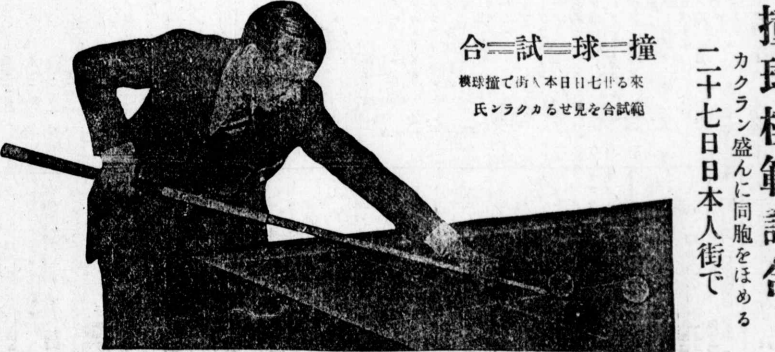
合一試一球一撞 機球撞て街本日日七廿の來 氏シラカカをせ見を合試範