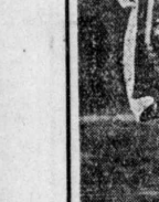
帝皇羅遜 市晩らか本日下目 るかに上途のへ