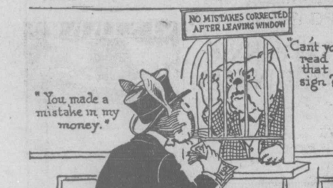
"You made a mistake in my money."