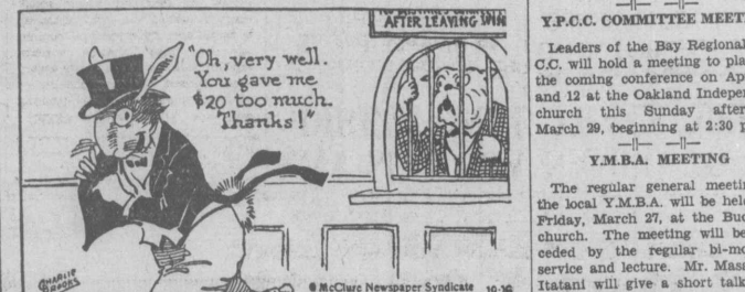
"Oh, very well. You gave me $20 too much. Thanks!"