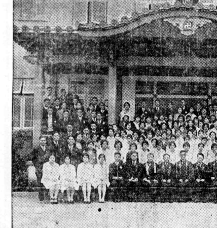
議會青佛女男東灣港桑たし呈を況盛の有曾未 是も兼意なきに來従は議會青佛女男の盟聯灣桑たれさ催開てい於に會教佛伊王日九十月十去 のもしせ影念記日當は眞寫のこ、がだり通の報正はそこた得取を果成の外意又てしき謹言