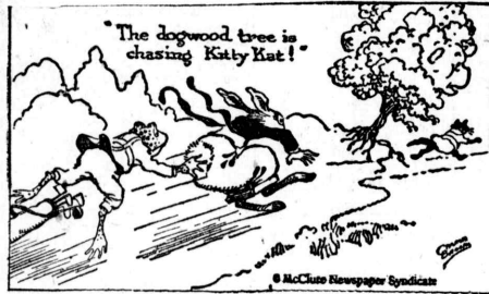
What's the matter Uncle Wiggily?