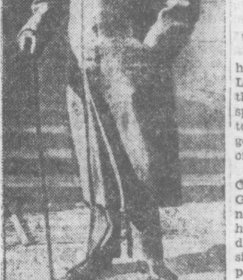
King George of England sent a telegram to H. I. M. the Emperor of Japan recently, thanking him and his subjects for hospitality shown his son, the Duke of Gloucester when he visited Japan to present the Order of the Purple Garter to His Imperial Majesty.

Cruises at Sixty As Flying Condition Is Improved