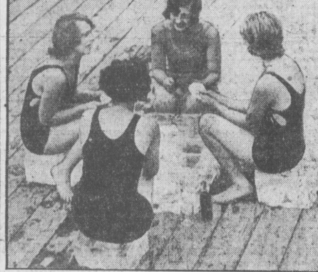
These Oswego Lake (Oregon) girls at least have solved the hot weather problem. Torrid summer days hold no terrors when you stage your parties on ice tables and ice chairs.