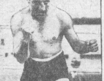
Joe Dundee of Baltimore, will defend his crown as world's welterweight champion against Jackie Fields of Chicago in 15-round bout at Detroit, on July 25.