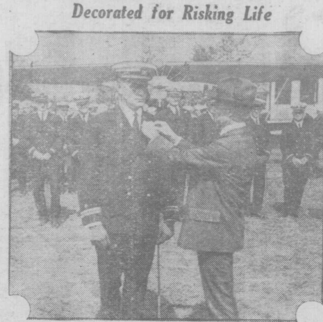
Lt. Alford J. Williams, during Navy test pilot, was decorated with the Distinguished Flying Cross by Secretary of the Navy Charles F. Adams for fearless efforts to solve aviation dangers. Williams is best known for his work in inverted flight and the deadly outside loop.

在米婦人の参考となる所多し 日本の婦人は、美醜點がある。それは、日本の文化、習慣、生活様式から来るものである。外國の婦人は、日本の婦人の美醜點を、客観的に見て、その長短を指摘する。これは、日本の婦人にとって、参考となる所多しである。