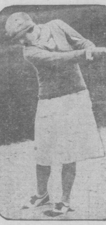
Although she fought gamely and at one time had a lead, Glenna Collett, American women's golf champion, was unable to answer the British title. She lost in the final round to Joyce Wethered, 3 and 1.