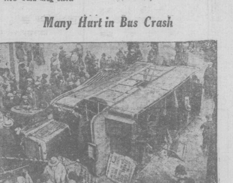
Striding photo shows the wreckage of a bus which overturned in London after colliding with a motor car. Close to 20 passengers were injured.