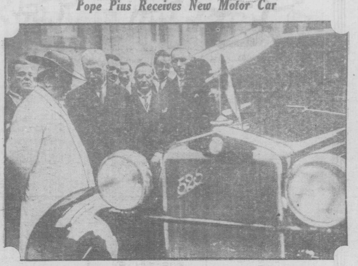
One of the very few times that Pope Pius has been photographed near the street—in the Plaza of St. Peter's—inspecting the new automobile which was presented to him. Senator Agnelli is explaining the motor of the car to the Pope.