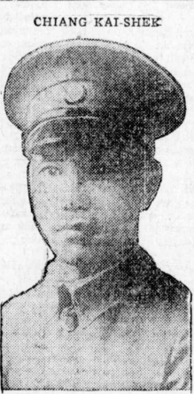
General Chiang Kai-shek, who is mobilizing his troops to meet the spring drive of General Pai against the Nationalist capital of Nanking.