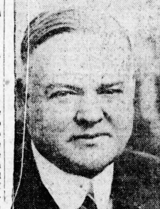
President Herbert Hoover (left) and Vice-President Charles Curtis, whose inauguration in Washington Monday stirred the entire nation. Hoover, first President from the West, is the thirty-first Executive of the United States. He is fifty five years old.