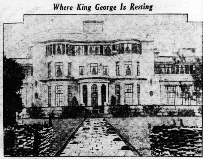
Where King George Is Resting... A view of Craigwell House at Bognor, England, where King George, who is slowly recovering from his illness...