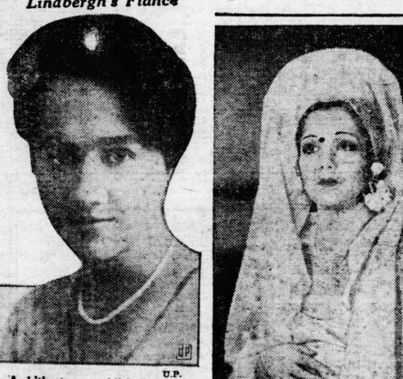
A hitherto unpublished photograph of Miss A. Morrow who will become wife of Col. Charles A. Lindbergh. Ambassador Morrow released this picture in Mexico City.