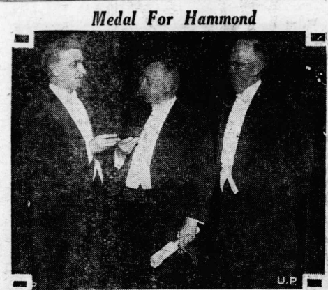
Medal For Hammond... Left to right, George Otis Smith, retiring President of the American Institute of Mining and Metallurgical Engineers...