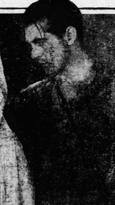
The "Wolf Song" is a love song now. Lupe Velez and Gary Cooper, whose engagement recently was announced, appeared together in a film success.