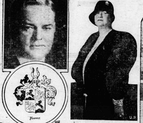
The American Heraldry Society, after delving into the genealogy of the President-elect (above) has unearthed a coat-of-arms which it believes belongs to the Hoover family.