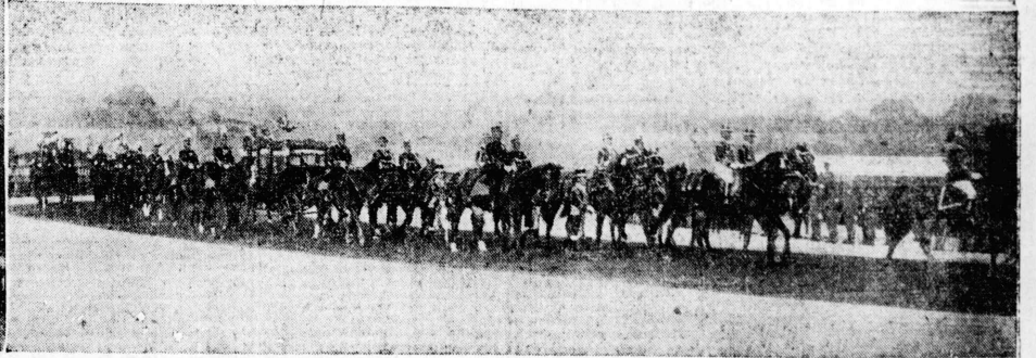
Special Coronation Photos