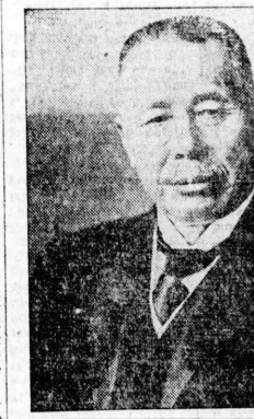
Premier Giichi Tanaka of Japan, who narrowly escaped the fate of K. Hara, Japan's great Liberal leader. Tanaka was injured but his aide sustained serious injuries.