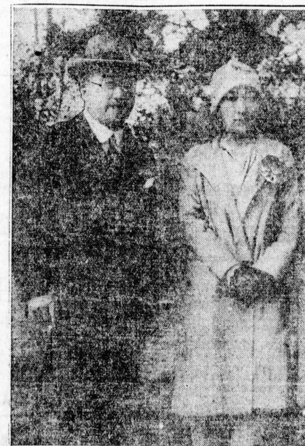
Ambassador Tsuneo Matsudaira of Japan with his daughter, Miss Setsuko, on the eve of the latter's graduation May 8, from Friend's College, Washington. Miss Matsudaira will leave San Francisco for Yokohama next month and will be married to Prince Chieba, heir apparent to the Throne of Nippon, in September.