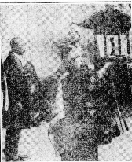
Scene at the ceremonies in Tokyo which commemorated the 2488th anniversary of the birth of the Japanese god, Buddha. The annual observance of this feast is always one of the most picturesque of Japanese rites.