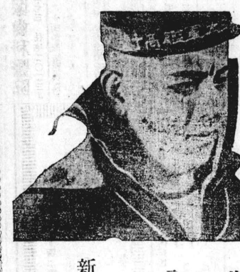
海軍省の後援により 帝國軍艦 總出動 新講談 鈴木南慶